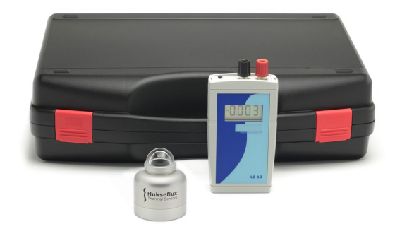
Figure 2 SR05-LI19 as it is delivered, in a practical transport case.