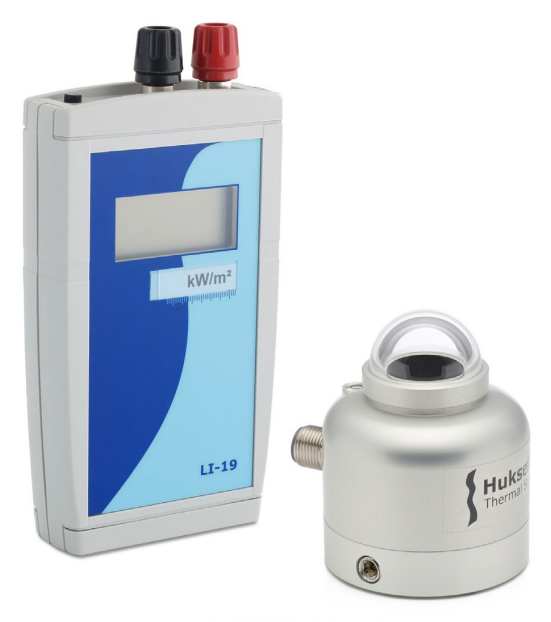
Figure 1 SR05-A1 pyranometer with LI19 handheld read-out unit / datalogger.

SR05 is a solar radiation sensor that is applied in most common solar radiation observations. SR05-A1, with analogue millivolt output, complies with the spectrally flat Class C specifications of the ISO 9060 standard and the WMO Guide. LI19 is a high-accuracy handheld read-out unit / datalogger. The SR05-LI19 combination is well suited for mobile measurements and short term datalogging.