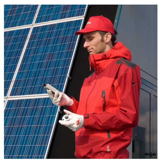
Figure 4 LI19 used with a pyranometer in a field measurement campaign.